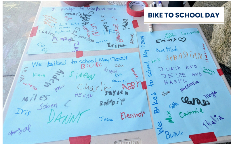
BIKE TO SCHOOL DAY