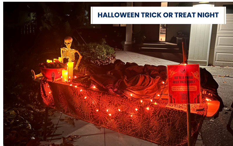
HALLOWEEN TRICK OR TREAT NIGHT